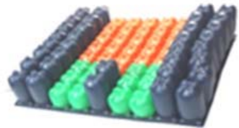
THE COLORS ARE USED TO SHOW THE DIFFERENT CELL HEIGHT POSSIBILITIES

STEPS TO FOLLOW TO FILL OUT THE MATRIX 1. Specify the requested size of the cushion W _____ " x D _____ " 2. Specify the cell height _____. If different heights are needed, indicate 2, 3 or 4 in each square to show each cell height. 3. Specify the number of valves as well as the valve position by writing a "V". If more than one valve is required, draw a line to show the compartment area. 4. If cells are not required, indicate an "X" in the square.